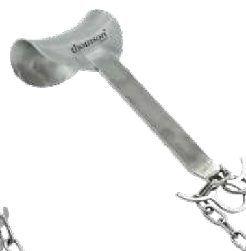
Balfour blade 2 TS/RR/BB/02 x 2 Unit