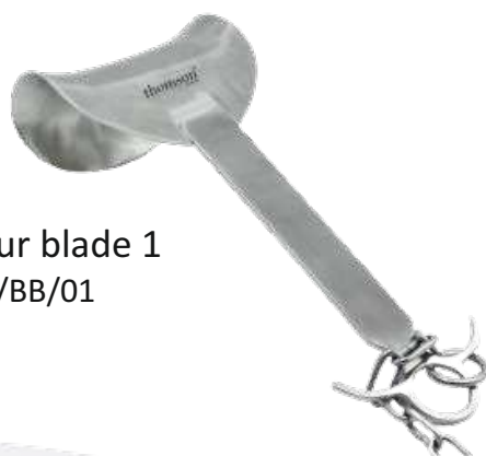
Balfour blade 1 TS/RR/BB/01