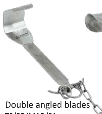
Double angled blades TS/RR/MAB/01